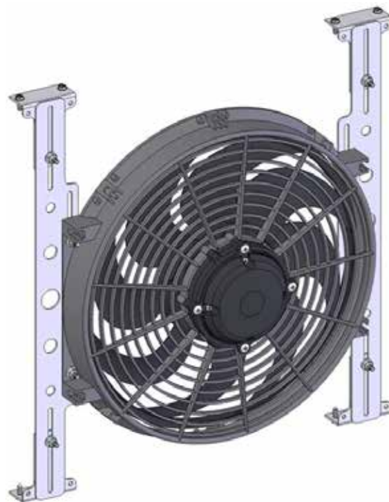
FIGURE 2 (FAN NOT INCLUDED WITH BRACKET KIT)