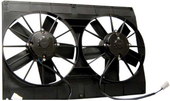
MACH TWO - NO FLANGE PART NO. MM22K